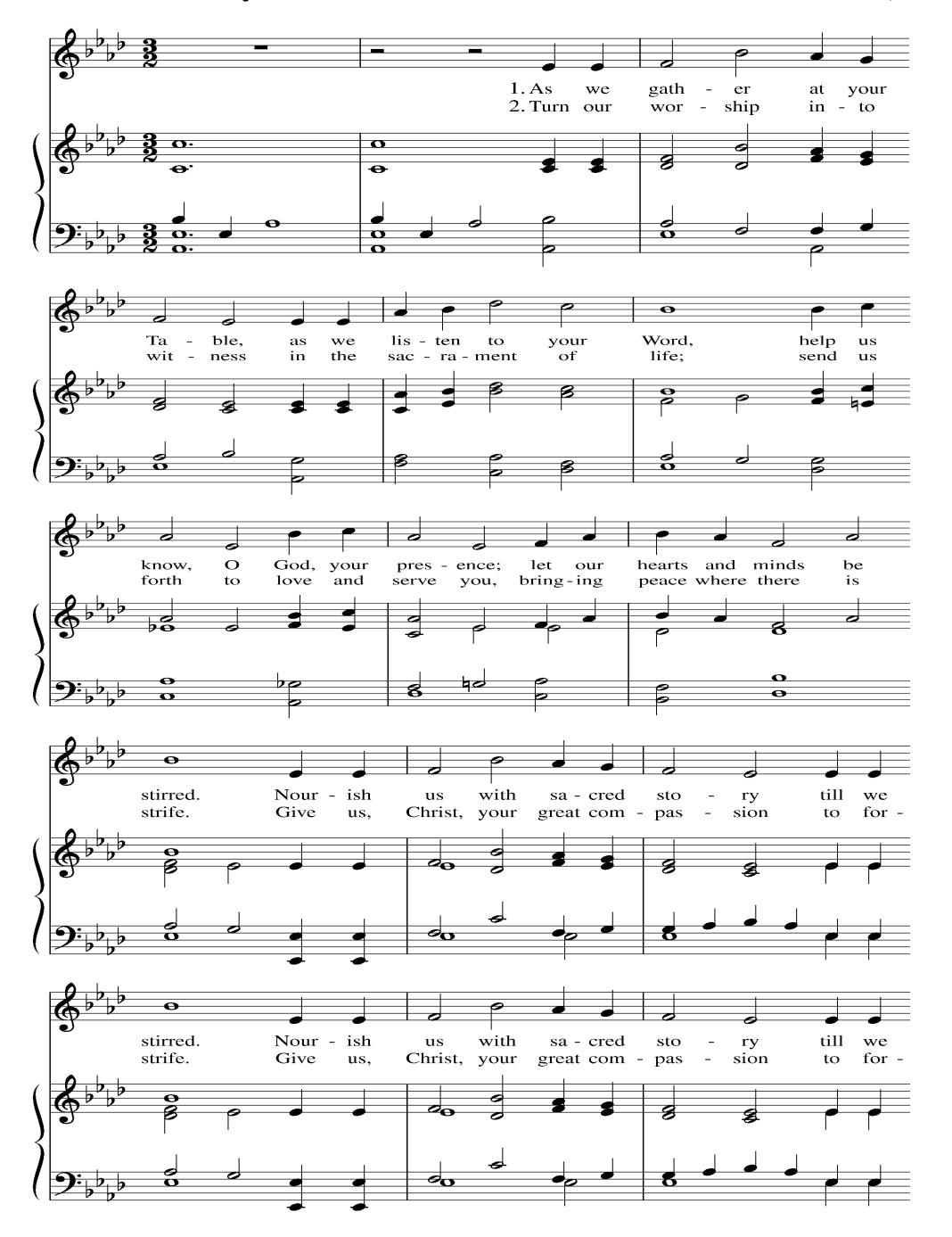
WLP 763, vs 1 and 2